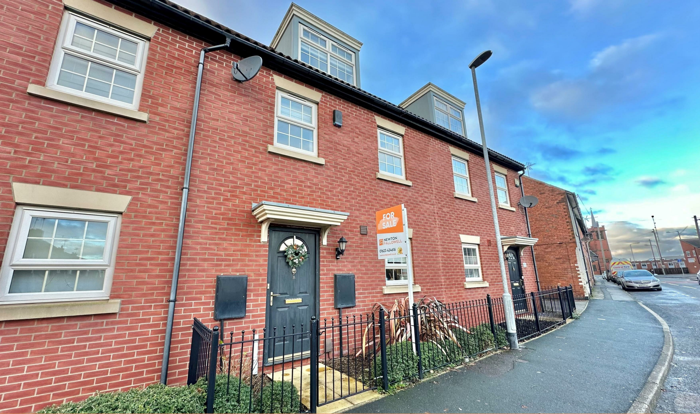
The Twitchell, Sutton-In-Ashfield, NG17 5DA